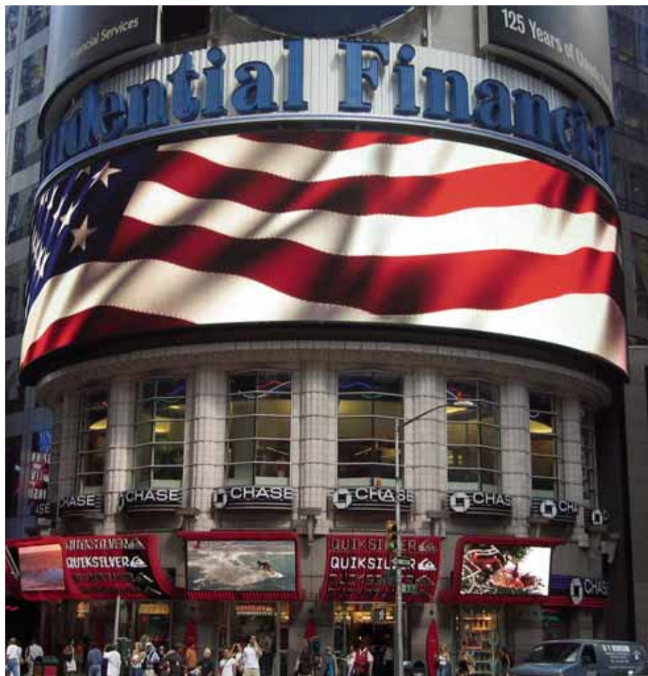
Figure 1 – The world's highest resolution LED display is based on Xilinx devices.

Video data starts in a control room and ends at the LEDs. The first step is the video processor, which is located in the control room. The video processor breaks the images into manageable chunks to send to the many modules of the sign so that each LED displays the data for the corresponding pixel. More than 3 Gbps of video data alone is required to operate the LEDs. In addition to video data, we also transfer a